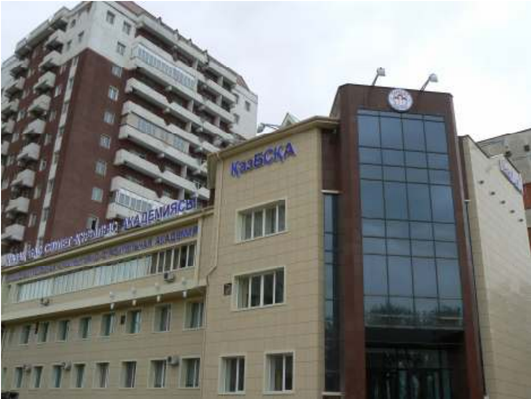
Views of KazGASA/ICE: